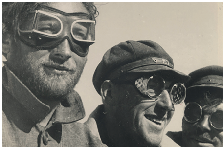
Viktor Turin Turksib , 1929 (USSR, 59mins, English subtitles) [Classic documentary]

Newsreel #63 is part of a wider project by Nika Autor to revive the newsreel film form. Often working with collaborators, her Newsreels combine voice-over with quotations from films, archival footage and footage of current events. Newsreel #63 centres on trains as symbols of hope and despair, and presents a collage of a succession of undercarriages - from Buster Keaton to today's stowaway migrants - along with footage of the old Belgrade-Ljubljana line.