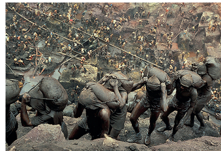
Alfredo Jaar Introduction to a Distant World , 1985 (Brazil, 9mins 30 sec) [Artist film]

Turksib charts the monumental efforts to build a railway linking the regions of Turkestan and Siberia in 1920s USSR. The film is remarkable for its use of montage and its portrayal of collective effort and modern engineering strength. A significant influence on the British documentary school, an English version of the film was prepared for exhibition by John Grierson in 1930. This remastered version features a newly commissioned soundtrack by Guy Bartell.