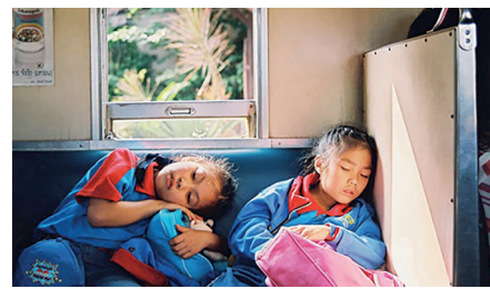
Sompot Chidgasornpongse Railway Sleepers , 2016 (Thailand, 102mins, English subtitles) [Long-form artist film]

Train-Trains: A Bypass is Stephan's second film focusing on collective and personal memory in relation to decommissioned train lines. Here she follows the traces of the old line linking Lebanon to Palestine, a coastal route that was part of the so-called Orient Express and Egypt lines before being put out of service. Stephan originally filmed the material in 1999 - as a personal vision of post-Civil War Lebanon, focusing on rural residents living near derelict stations.